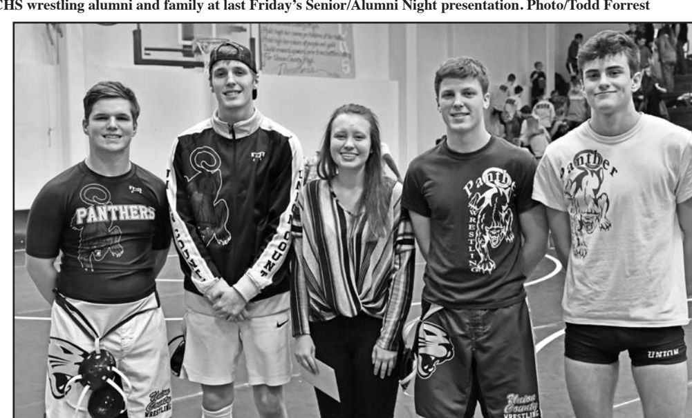
Union County senior wrestlers and manager.

As mentioned earlier, Area Duals will take place on Jan. 11 and 12 at Monticello. Traditional Area will be Feb. 1-2 at Elbert County