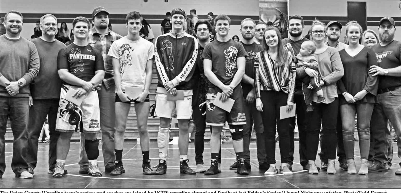
The Union County Wrestling team's seniors and coaches are joined by UCHS wrestling alumni and family at last Friday's Senior/Alumni Night presentation.

The Panthers bounced back with victories over Hart County and Chattooga County while also scoring a forfeit win over Fannin County, who was unable to compete in the final round of the evening